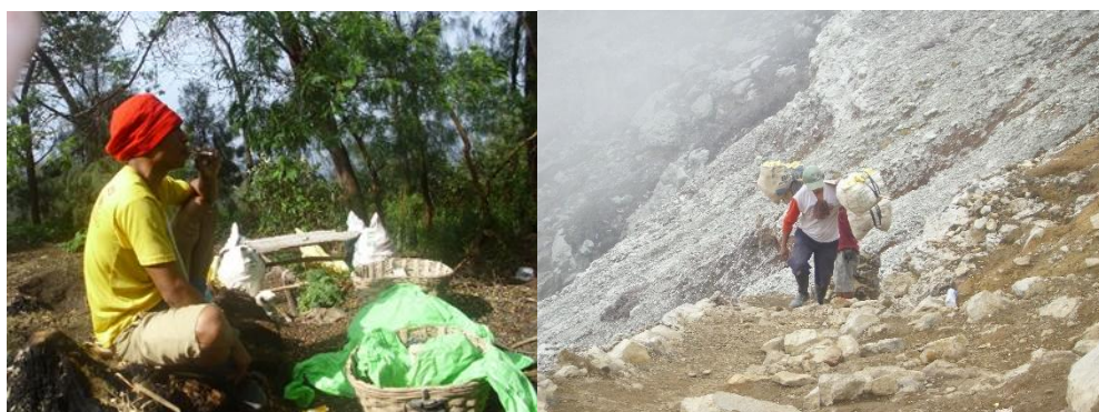
Image1. Difference of 20 year-old miner and 64 year-old miner

The age of miners up to 2013 ranged from 20-64 years old, with a payload capability of about 40 to 100 kg per person. However from 2013 until now many miners who are still young decided to stop being miners, miners who are young choose another job. This is because the inability of young miners with jobs that require a very strong power. For once transport, the sulfur miners can bring home the money amounting to 36,000 IDR to 99,000 IDR.